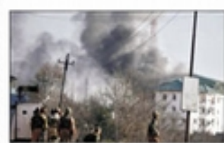
SRINAGAR: Three militants holed up in a massive government campus in Pampore on the outskirts of Srinagar in Jammu and Kashmir have been killed after a 48-hour-long gun battle, in which three Army para commandos, including two Captains, and three others died.

This was the deadliest firefayen or suicide attack near Srinagar in six years. Snapping up operations are now