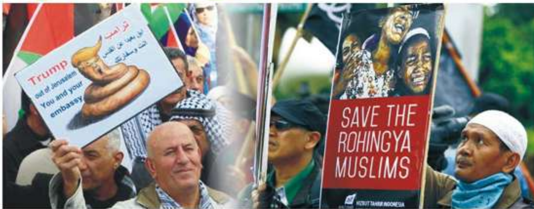
ای 2017ء میں ایک مہاجر پھر روہنگیا مسلمانوں کا مسئلہ شدت