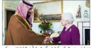
سعودی ولی عہد محمد بن سلمان نے برطانیہ کی وزیر اعظم ٹیریزا می کے ساتھ ملاقات کی۔

مشترکہ قریب میں امریکہ کا دورہ بھی کر لے رہا ہے، ہیں کیا ان اور ان کا مکمل مقصد ایران سے متعلقہ کینیڈا کے مغرب کی حمایت حاصل کرنے ہے؟ سعودی ولی عہد محمد بن سلمان کی کینیڈا کی سفری تقریب کی تمام تفصیلات سنبھالنا ہے تاکہ سعودی فرمائندہ ملک سلمان کی قریبی امت کے پیش نظر کھنڈہ جاسٹس کی دیکھنا ہیبت حاصل کر سکتے ہوں۔ بن سلمان کا دورہ مقصد ایران کے ساتھ ساتھ بن سلمان کی حمایت حاصل کرنا ہے۔ سعودی ولی عہد نے برطانیہ میں بھی ایران بڑی اور دولت مند کو شیلڈنگ کی شکل میں فراہم کیا ہے۔ لیکن ان کا مکمل توجہ امریکہ کی طرف ہے اور وہ اس بار سے میں بری دیکھنا کی حمایت حاصل کرنے کی کوشش میں مصروف ہیں۔